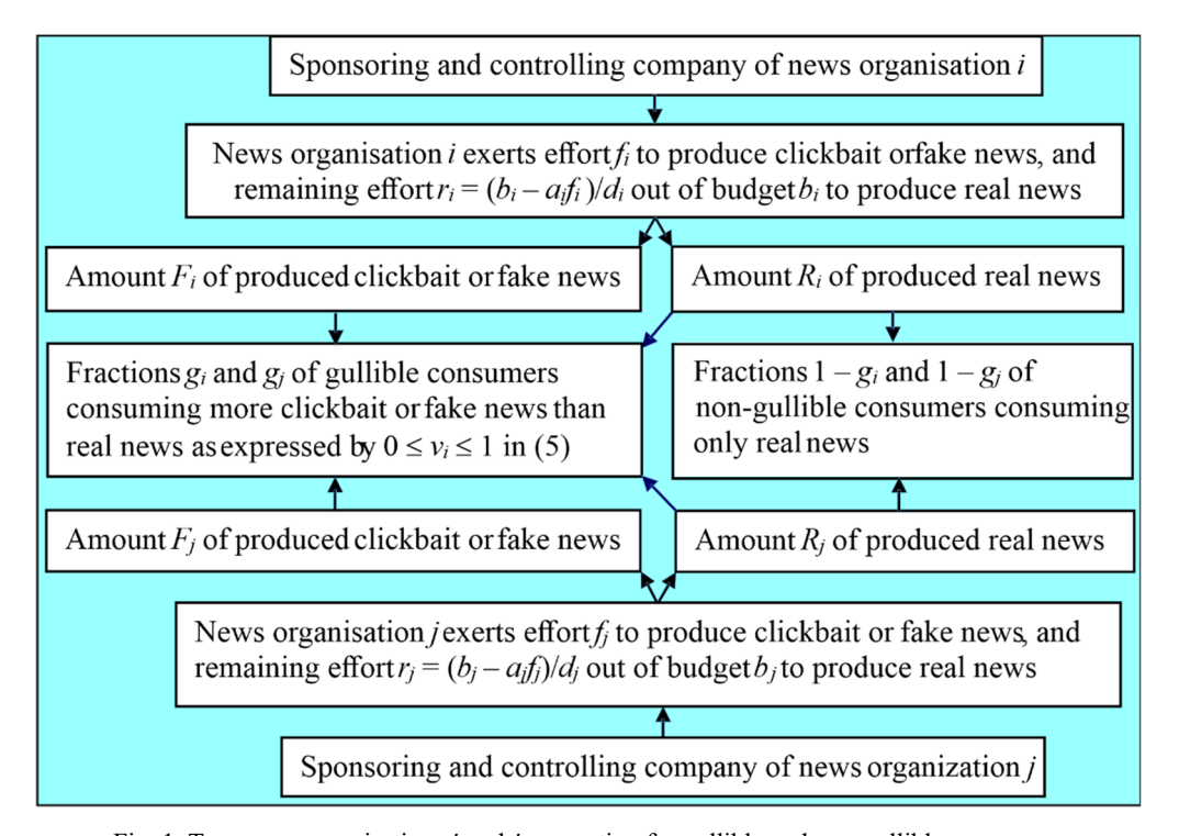
Fig. 1. Two news organisations i and j competing for gullible and non-gullible consumers

This section considers two competing news organisations i and j, which can be interpreted as one organisation i competing against the rest of the news industry expressed as j, as shown in Fig. 1.